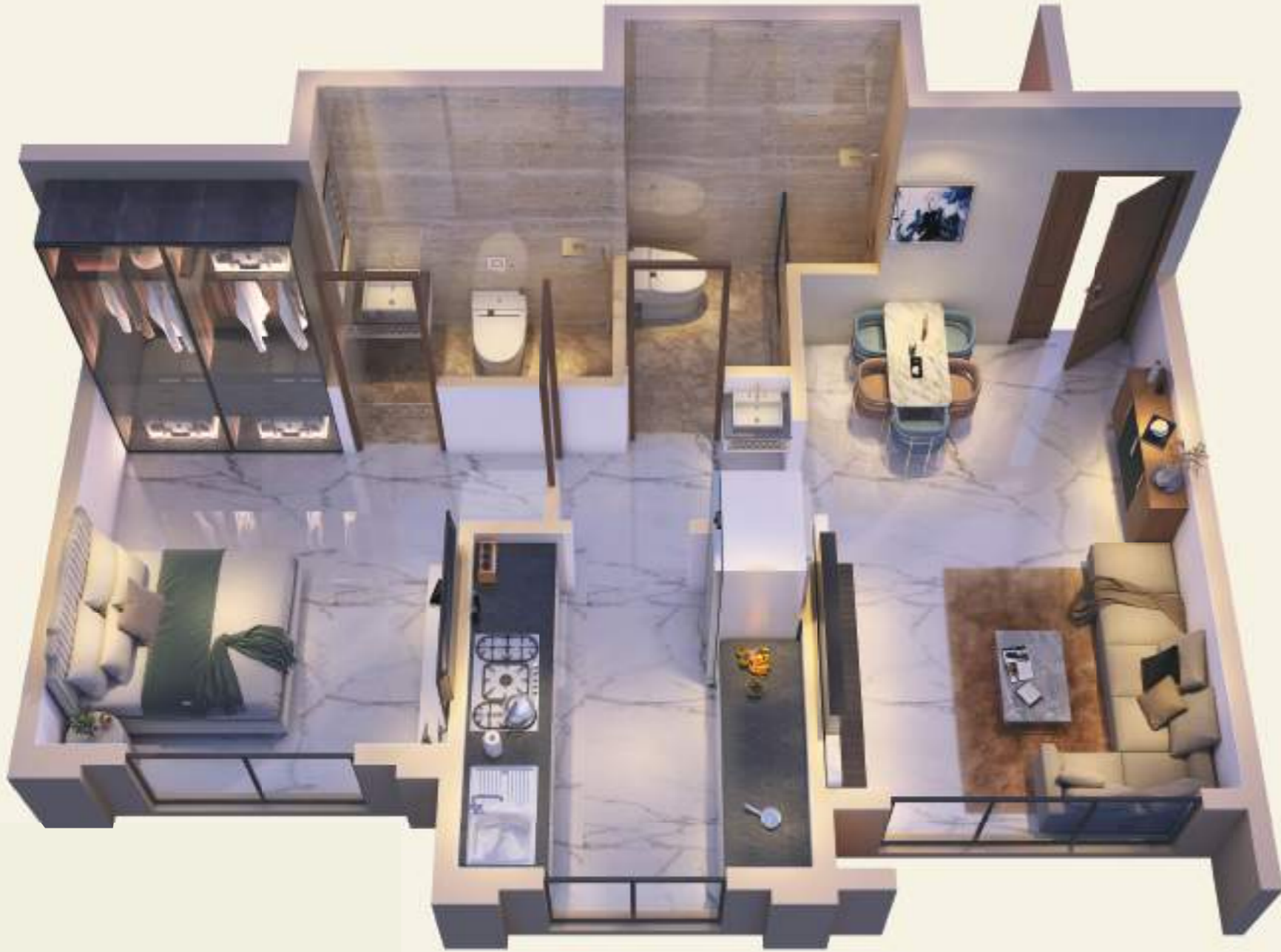
1 BHK UNIT PLAN